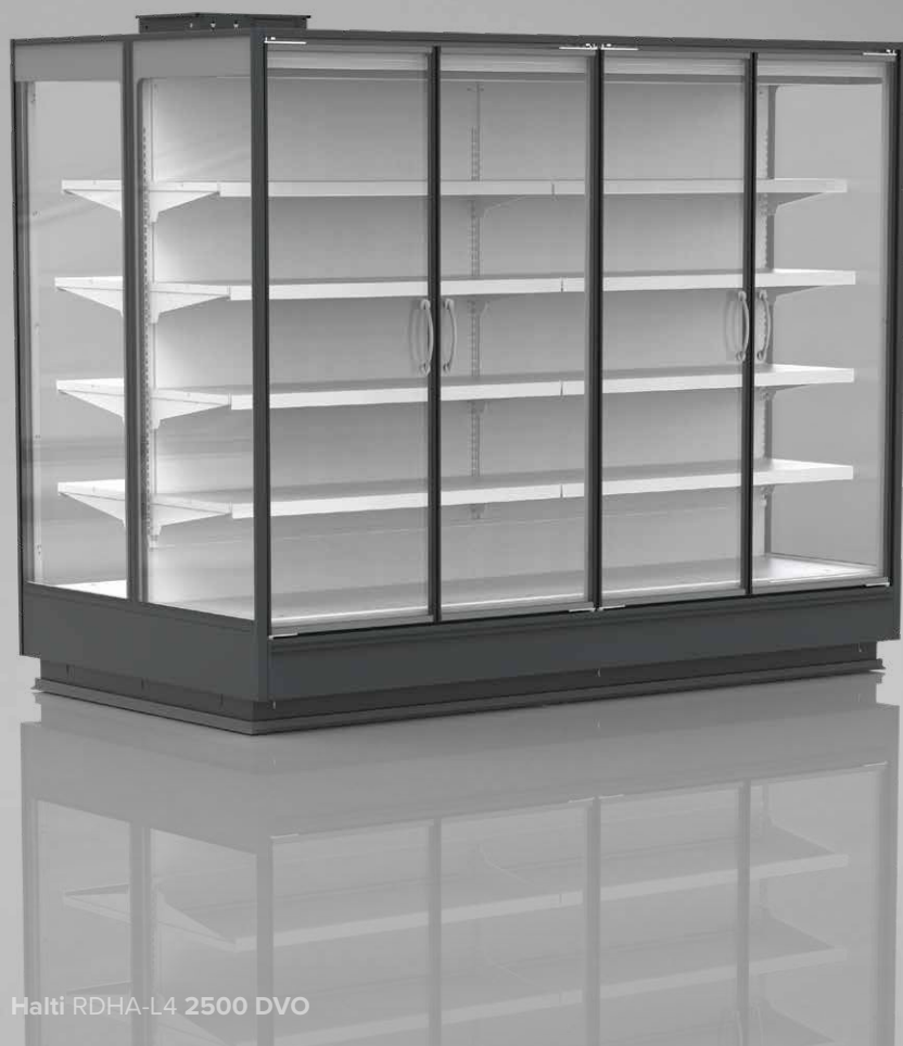
Halti RDHA-L4 2500 DVO

DVO – door I double, straight (High Vision) I hinged